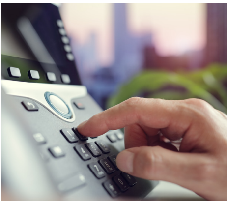
VoiceMail on CX-E