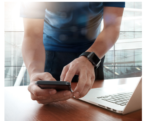
VoiceBase sends email with a text transcript of the voicemail to the user, along with the original audio